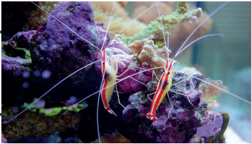
Marine and freshwater invertebrates