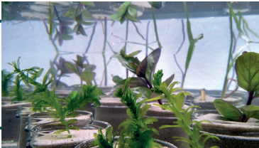
Macrophytes (free-floating, submerged, emergent)